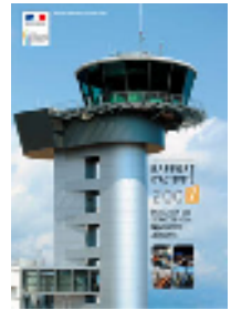
DSNA Annual Report